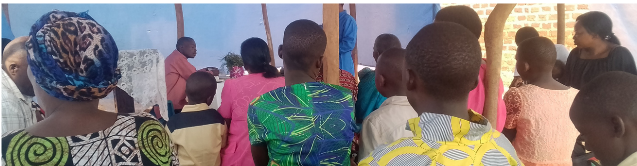
LOCAL HUBS - #EVOLVE