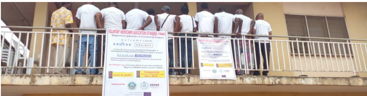
LOCAL HUBS - #EVOLVE