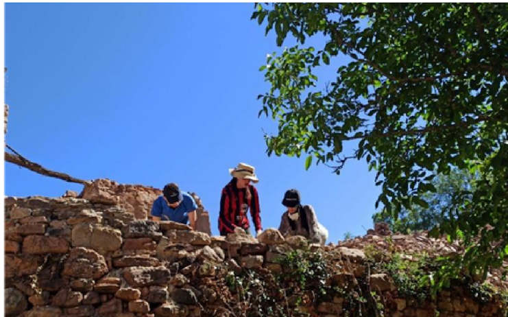
Eco-camp in Envall (Catalonia), July 2022

Furthermore, we completed these guidelines with the lessons learned from our pilot eco-camps.