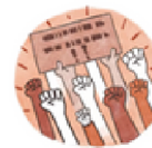
Social and political peace