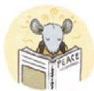
What is peace?

https://sci.ngo/resources/online-courses/