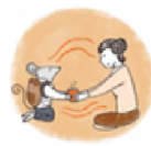
Peace with others